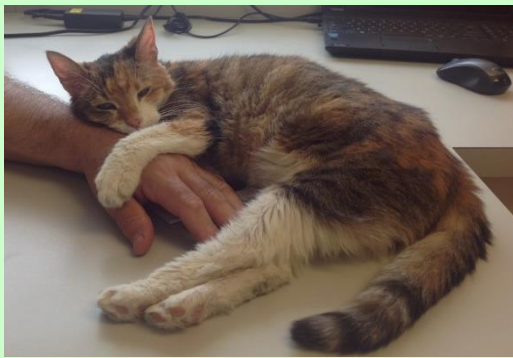
New clinic cat, Jezebelle

Jezebelle came to The Cat Practice when her human passed away. She has quickly made lots of friends and is very comfortable in her new home. The next time you are at The Cat Practice, be sure to stop and say hi to Jezebelle! She loves human food so don't turn your back on her if you have anything tasty!